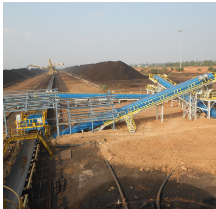
MSS built and operated by SGS in India